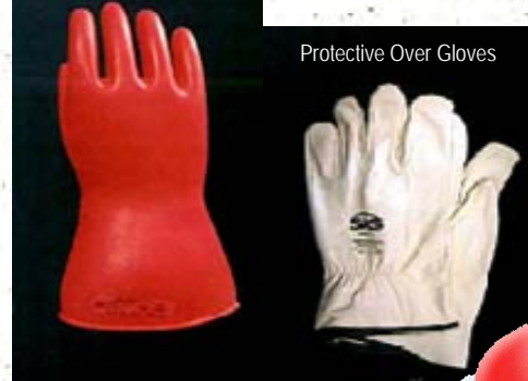
Protective Over Gloves